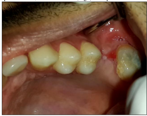
Fig 6: 15 Days later

The suture was removed after a 15-day postoperative period without complications (Fig 6); the patient presented an advanced stage of proliferation of the epithelial tissue of the mucosa on the adipose tissue. Six months after surgery, the healing of the wound and the complete closure of the defect, which was completely epithelialized, could be noted (Fig7). The patient was