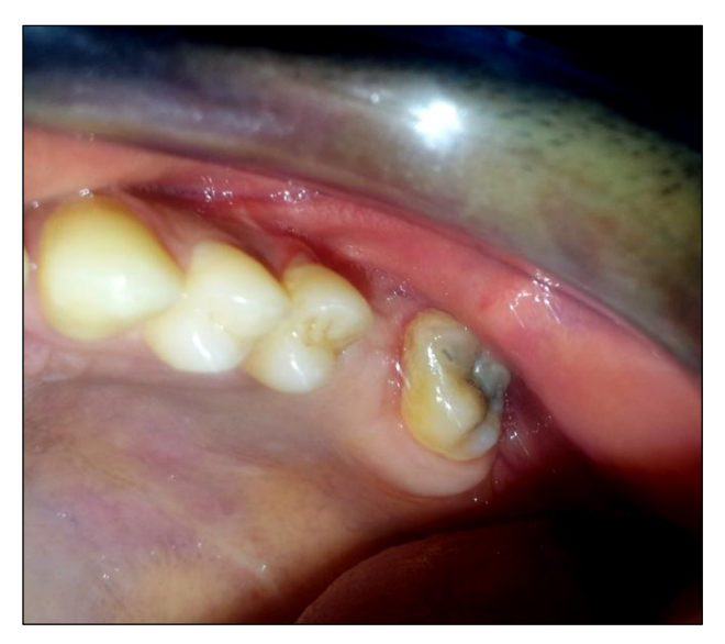
Fig 7:6 Months later

afterwards followed up over a period of one year and showed a complete healing of the wound, with no complications (Fig 8).