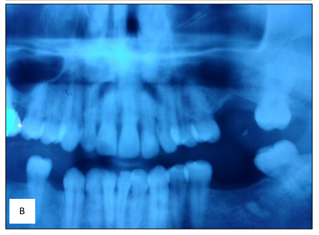
Fig 2 (A, B): Panoramic X-Ray showing the bone defect in the previous extraction site leading to a perforation in the floor of the left maxillary sinus