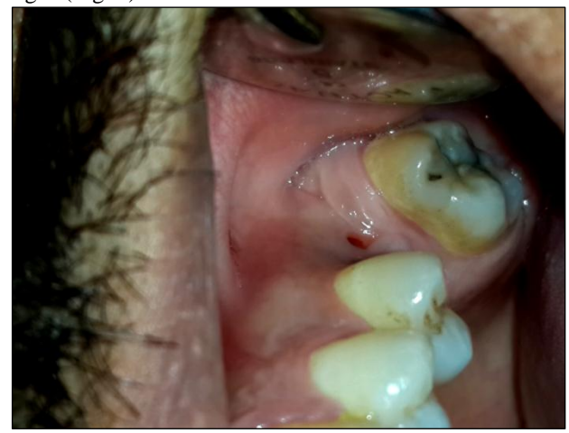
Fig 1: Intra-oral view showing the oro-antral fistula

Clinical intra-oral examination revealed an approximately 5 mm fistula linking the oral cavity to the left maxillary sinus, with absence of pus and systemic inflammatory signs (Fig. 1).