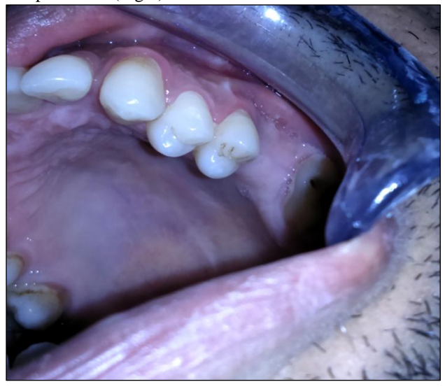
Fig 8: 1 Year later

afterwards followed up over a period of one year and showed a complete healing of the wound, with no complications (Fig 8).