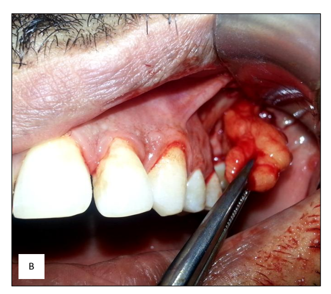
Fig 4 (A, B): The buccal fat pad dragging into the fistula's site